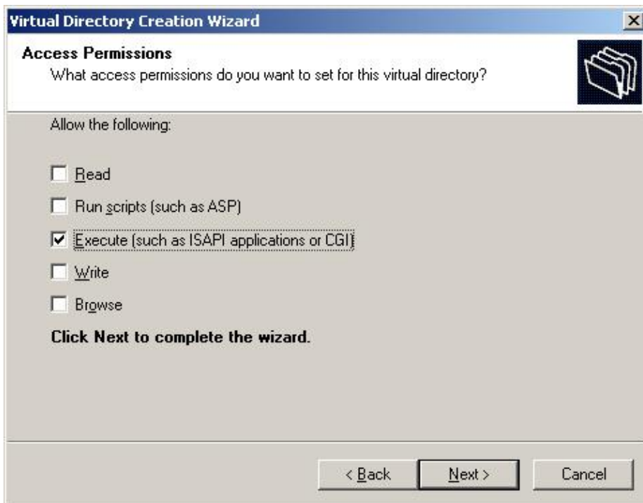
Figure 5-7: Enabling CGI Mode