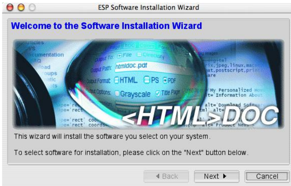
Figure 1-2: The software installation wizard

Double-click on the Install icon in the Finder window to start the software installation wizard (Figure 1-2) and follow the installer prompts.