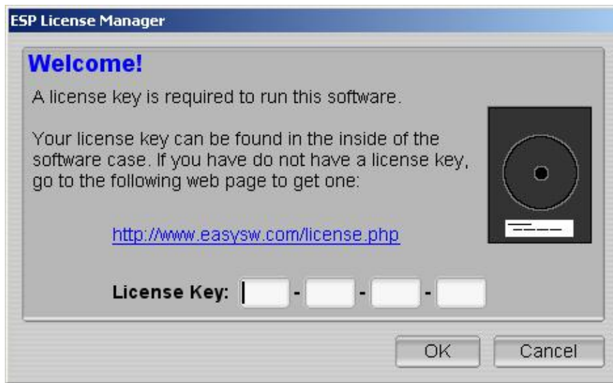
Figure 1-4 - The HTMLDOC License Dialog

Enter the license key that was emailed to you or came on the inside of the HTMLDOC CD-ROM case and click on the OK button. Click on the Close button to start using the software.