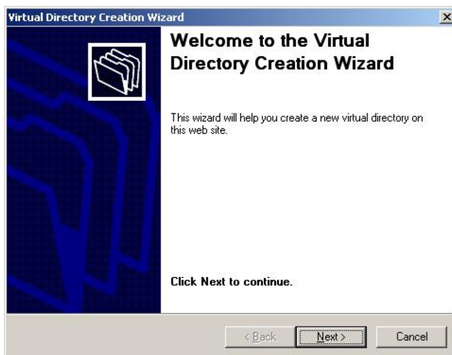
Figure 5-4: The Virtual Directory Creation Wizard Window