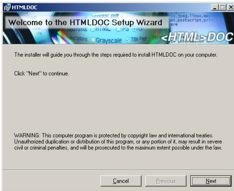
Figure 1-1: The Microsoft software installation wizard