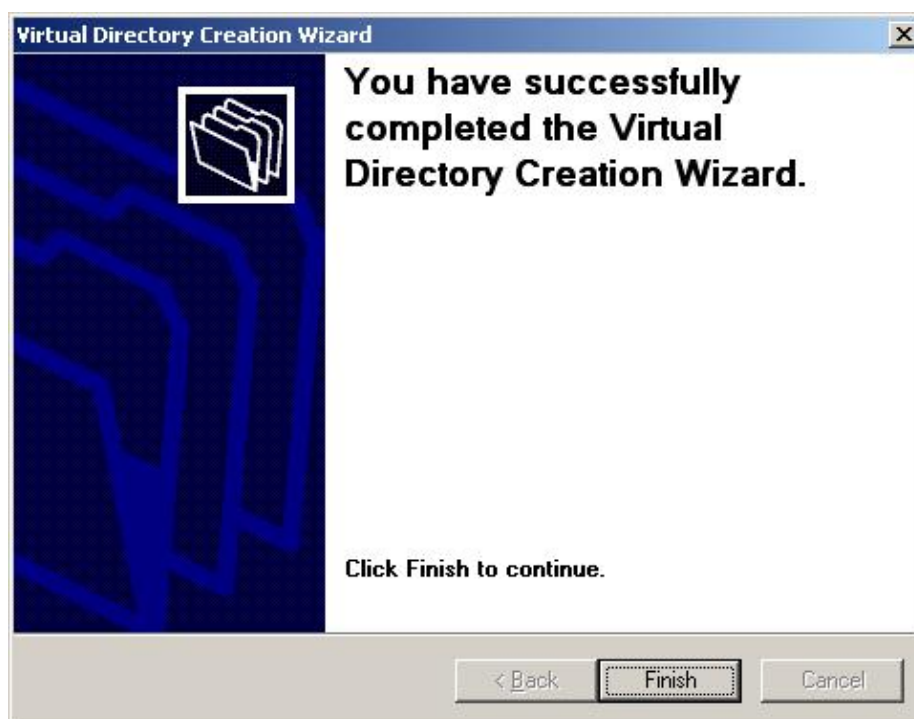
Figure 5-8: Completion of IIS Configuration

Once configured, the htmldoc.exe program will be available in the web server directory. For example, for a virtual directory called cgi-bin , the PDF converted URL for the superproducts.html page would be as follows: